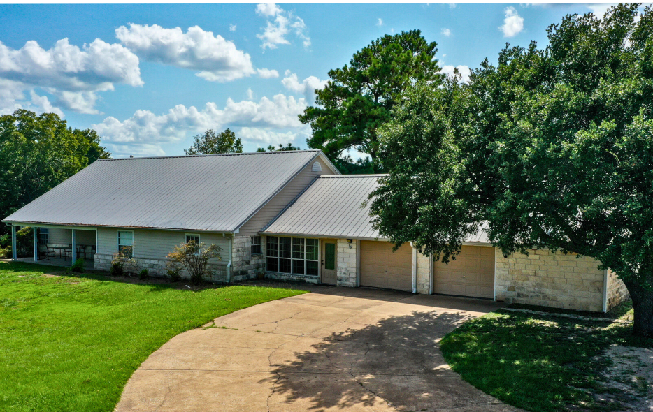
Main Office Approx. 3,850 sq.ft. under roof